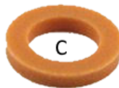
Polyelastetomer Cushioning and Seal washer