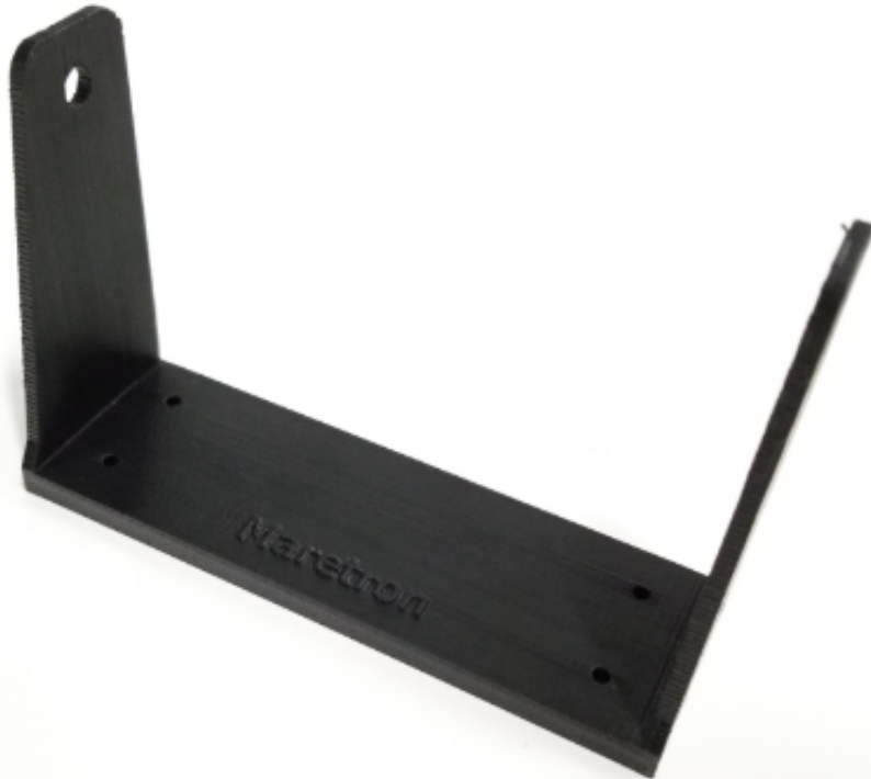
Printed DSM410 Gimbal

Here is what your Gimbal project should look like completed.